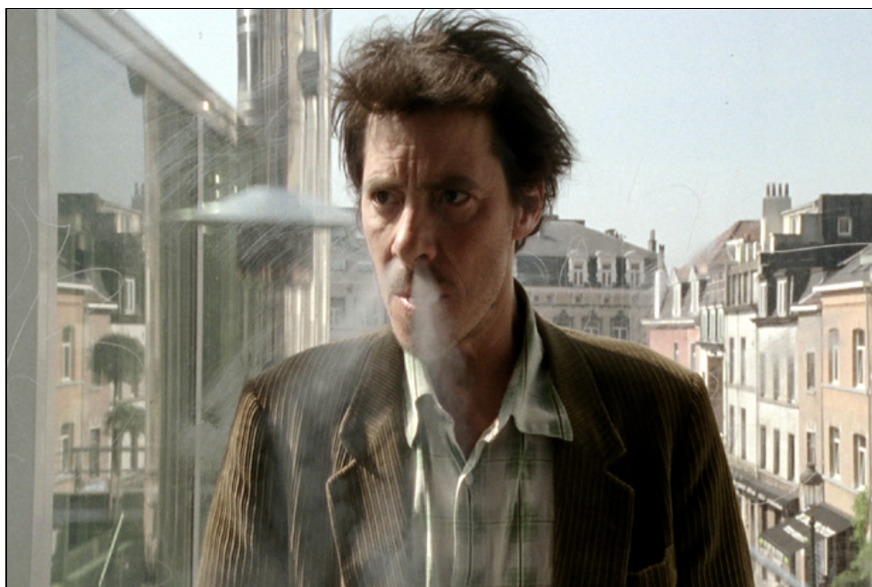
Il Ne Fait Pas Soleil (The Sun Doesn't Shine), Canada, 2011