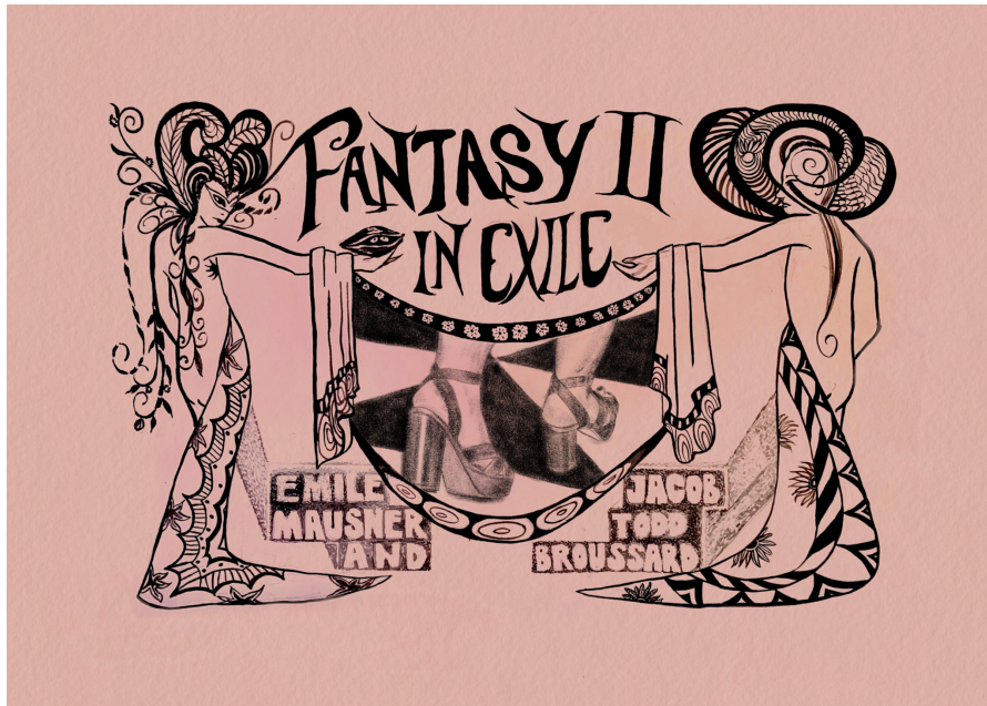
Pictured: Fantasy II in Exile Exhibition Poster