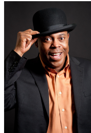
Pictured left - Rich Vos, center - Jimmie Walker, & right - Michael Winslow