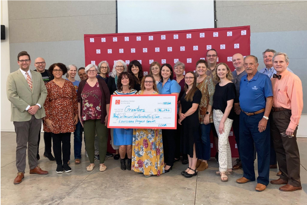
Image description: Photograph of FY23 Louisiana Project Grant recipients and AcA staff and board members holding giant check.

LAFAYETTE, LA - May 2, 2023 - Submissions are now open for Acadiana Center for the Arts (AcA)'s Louisiana Project Grant, which supports creative community projects in Acadiana with up to $7,500 in funding. The deadline for submissions is Friday, June 30th at 5pm, and AcA hosts a public information session on the grant (both in-person and virtual) on Friday, May 12 at 10am. Register online here for the session or visit acadianacenterforthearts.org for more information.