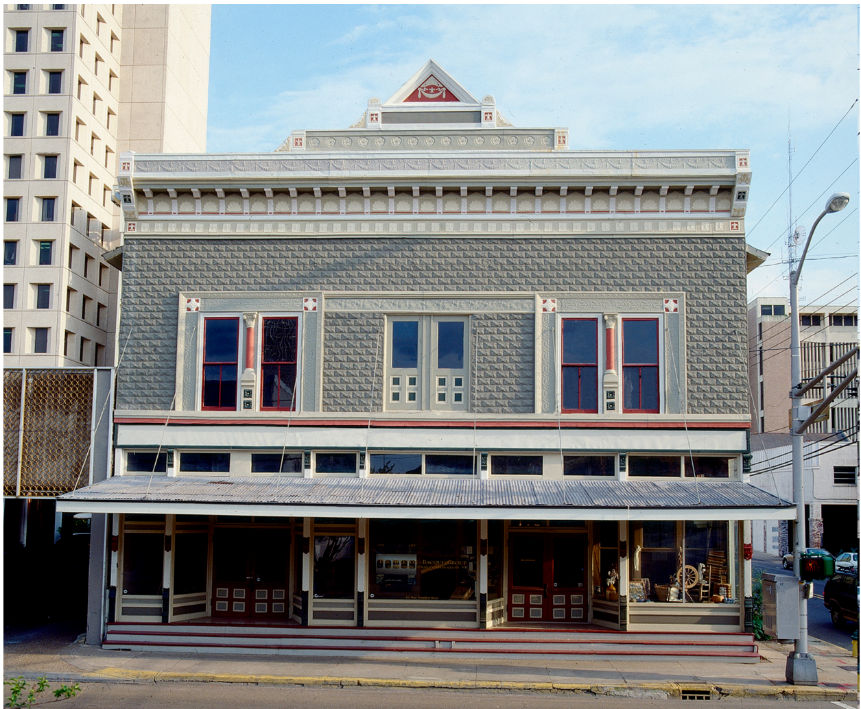
Photo: Home of the future Louisiana Music Museum, the Old Lafayette Hardware Store at the corner of S. Buchanan St. and W. Vermilion St. in Downtown Lafayette.