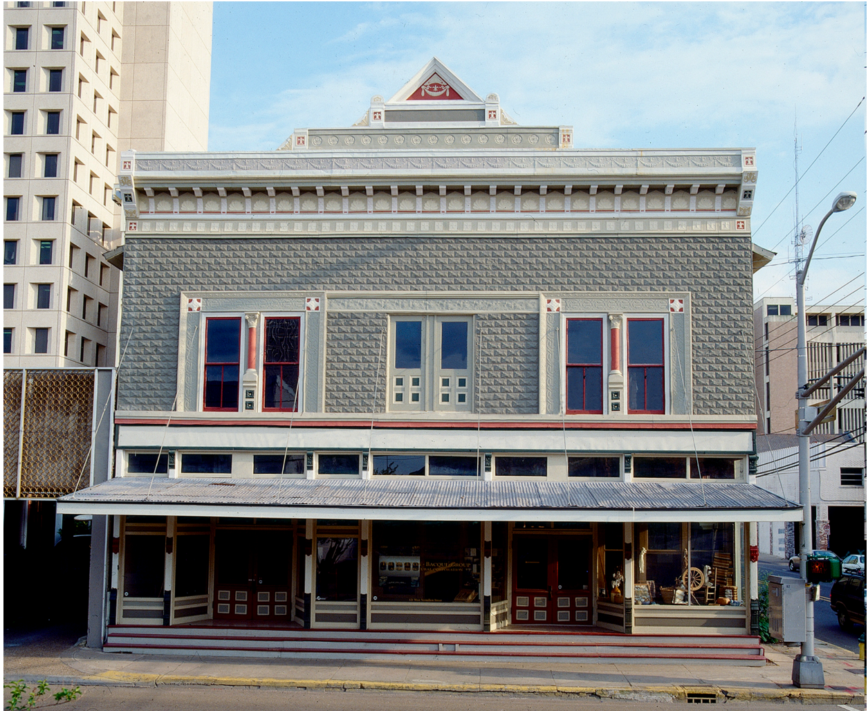
Photo: Home of the future Louisiana Music Museum, the Old Lafayette Hardware Store at the corner of S. Buchanan St. and W. Vermilion St. in Downtown Lafayette.

LAFAYETTE, LA - Acadiana Center for the Arts (ACA) announces selection of global experiential design and technology company Art Processors and local architecture firm Moliere Chappuis Architects to lead design of the Louisiana Music Museum.